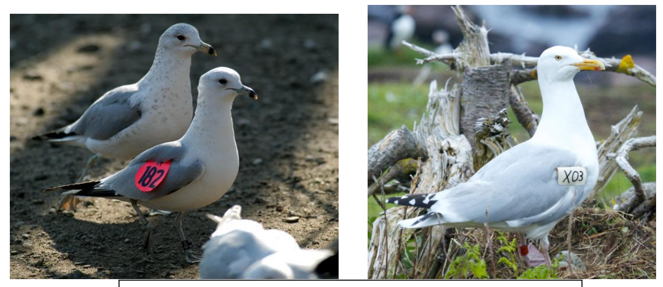
Figures 4 & 5. Wing-tagged gulls.

The other type of mark used on gulls is a wing tag (Figs. 4, 5 & 6). Wing tags are much larger than leg bands and, therefore, easy to read in the field. Most projects that use wing tags also use leg bands.