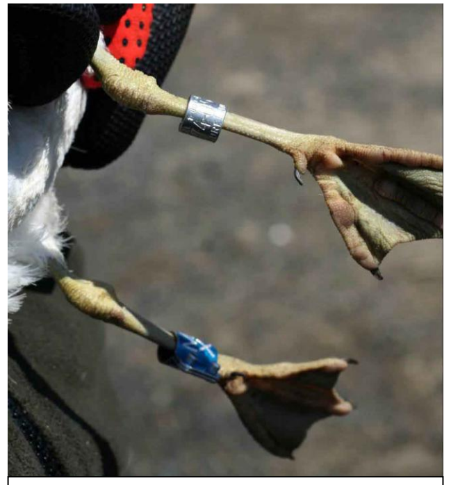
Fig. 2. Metal field readable band on left leg.

"field readable." Field readable bands are made out of metal (Fig. 2) or plastic (Fig. 3).