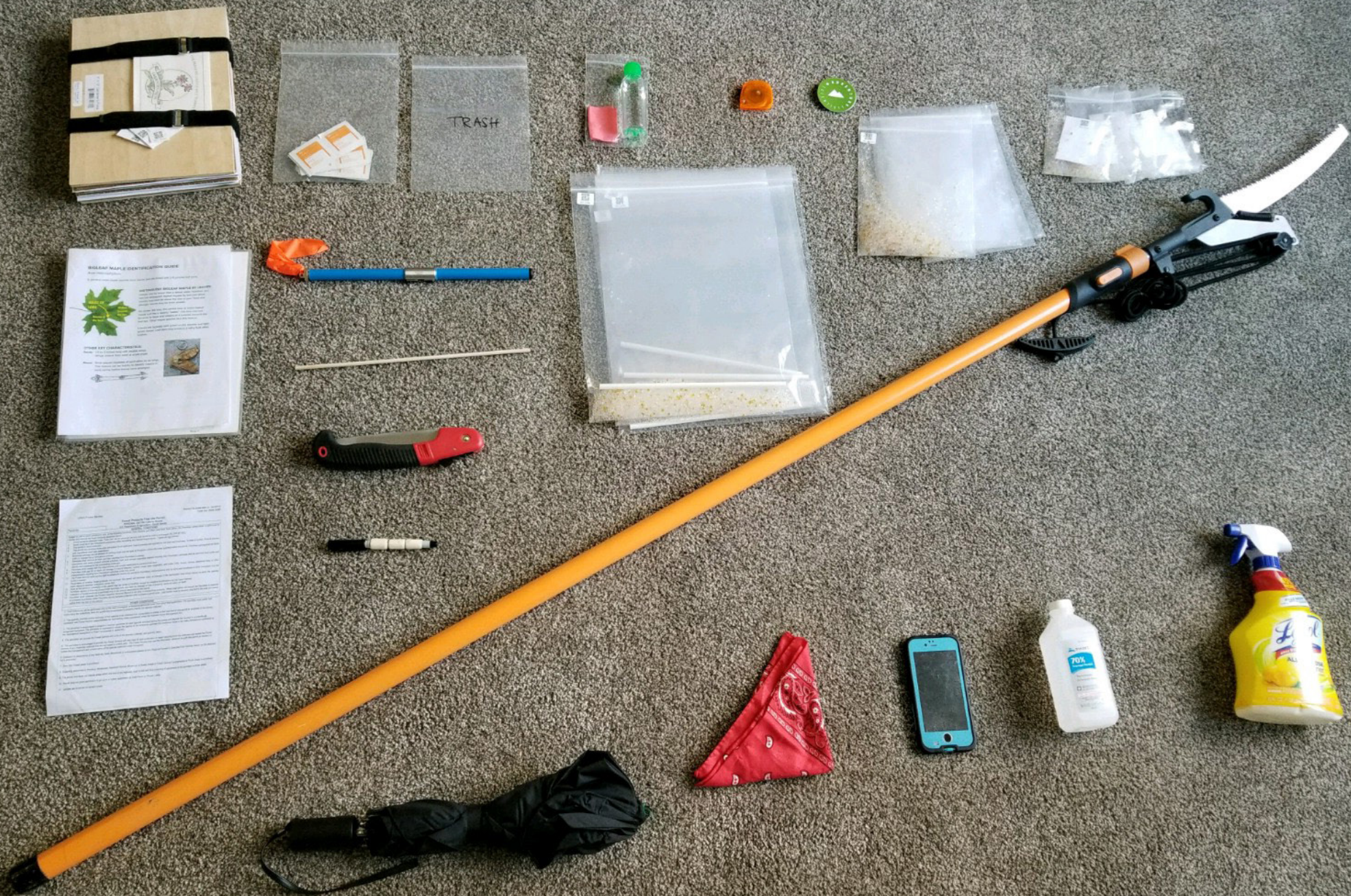
WOOD CREW EQUIPMENT CONSISTED OF SAMPLING PACKETS, A PLANT PRESS, AN INCREMENT BORER, A POLE SAW, A HANDSAW, A CLEANING KIT, AND A LIGHTWEIGHT MEASURING TAPE.