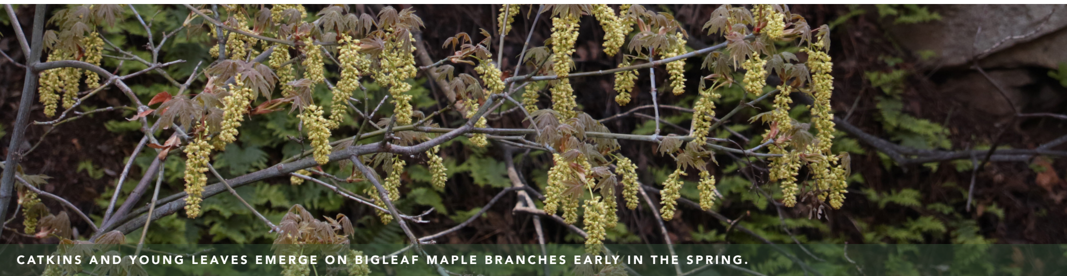
CATKINS AND YOUNG LEAVES EMERGE ON BIGLEAF MAPLE BRANCHES EARLY IN THE SPRING.