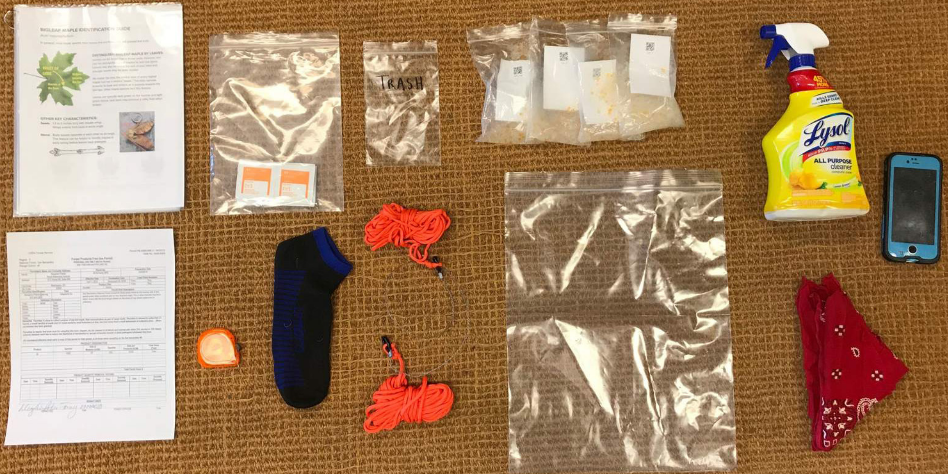
LEAF CREW EQUIPMENT CONSISTED OF SAMPLING PACKETS, A SAW-TOSS TOOL, ALCOHOL WIPES, AND A LIGHTWEIGHT MEASURING TAPE

webinar and quiz raffles, and the "September Sprint," a late-season challenge to collect as many samples as possible.